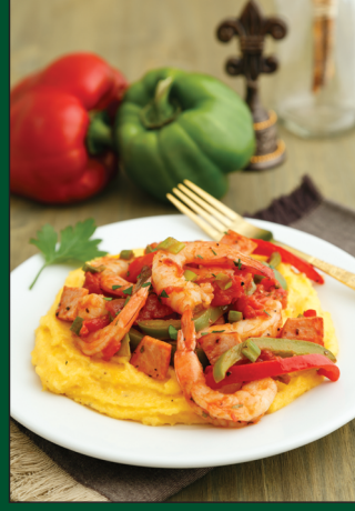
Sautéed Shrimp and Peppers over Cheese Grits